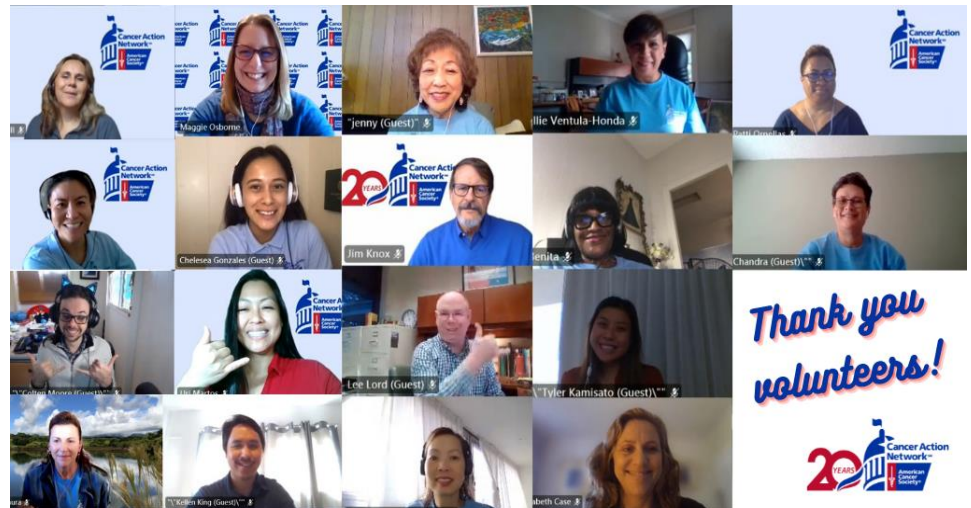
ACS CAN volunteers excited to participate in this year's virtual Cancer Action Day!

On Cancer Action Day, ACS CAN advocates asked lawmakers to preserve the Tobacco Prevention Control and Cessation special fund which has helped the decline of tobacco use for over twenty years in Hawaii from a 1999 Master Settlement Agreement (MSA) reached between the State and tobacco companies to address future health costs from tobacco use. 12.5% from MSA is allocated to the special fund to prevent youth from starting tobacco use, cessation efforts to help adults quit tobacco, and to keep the Hawaii Tobacco Quitline running. Advocates also asked lawmakers to support cancer research for treatments to improve cancer patients' and survivors' quality of life.